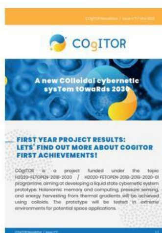
ISSUE N. 2: May 2022