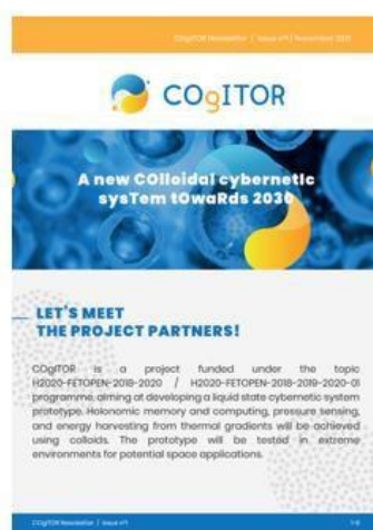
ISSUE N. 1: November 2021