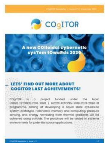
ISSUE N. 3